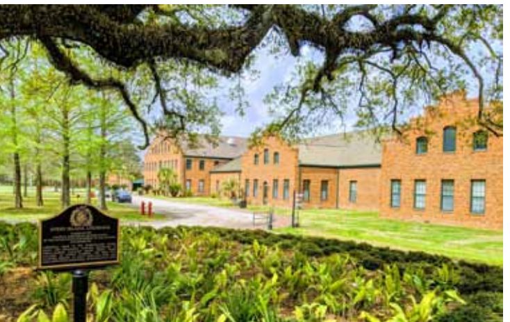
RW Gardens Tabasco Factory

built on another local salt dome under a small lake which in 1980 catastrophically collapsed whilst being drilled for oil resulting in a vortex, flooding, mud slides and the swallowing a newly built house and 65 acres. The lake eventually increased 1000% in size. We drove back to the RV Park to relax then to a provided wine and cheese event at the Park's Big Pavilion. Nancy and I then went back into town to eat at a nice restaurant: Jane's Seafood and Chinese Restaurant!