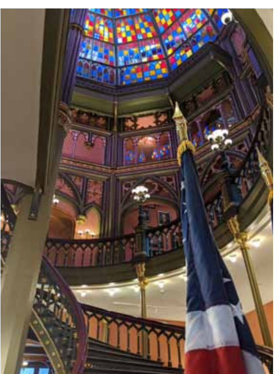
Old State House

fun getting to know them! Following the opening series of events we made our way back to the 1968 Globetrotter to relax and call it