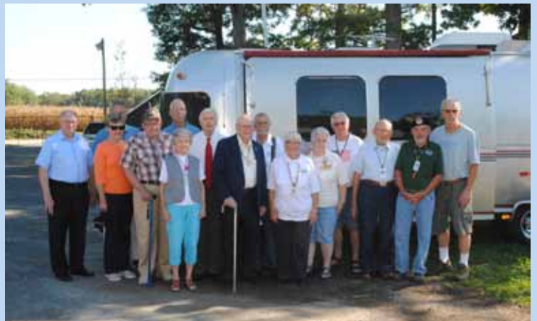
Past Presidents at the 50th Anniversary Dinner