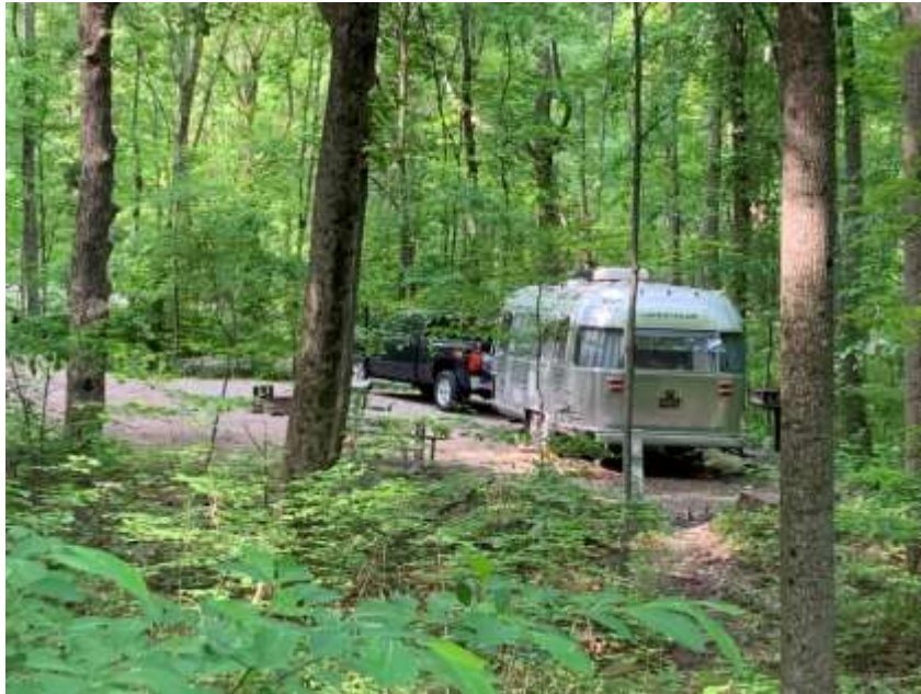
Spring 2019. The Dowells set up in Ohiopyle State Park, PA.

A few pictures below that I took from our recent trips to PA state campgrounds that will be on the Pennsylvania Caravan itinerary.