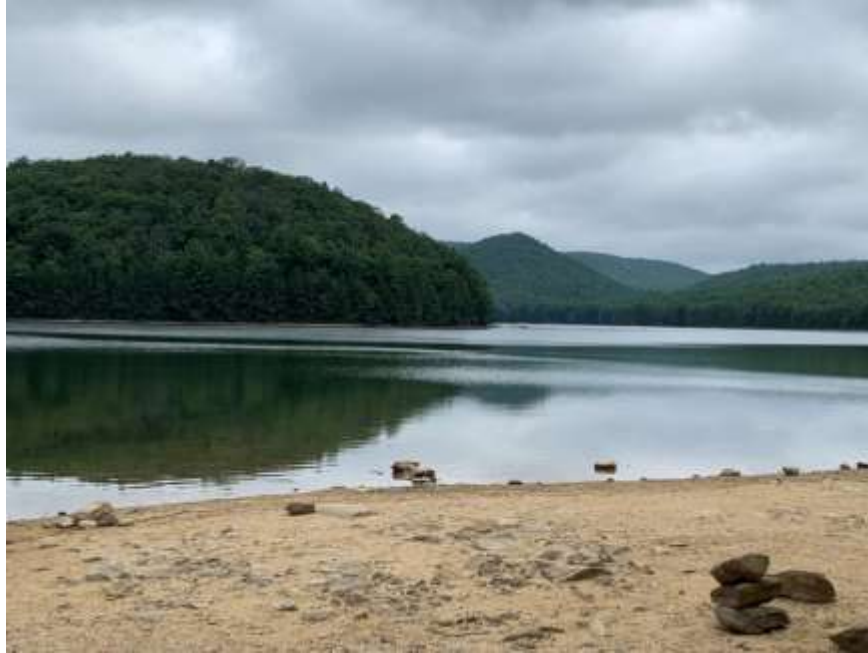
September 2020 Long Pine Run Reservoir at Caledonia State Park,