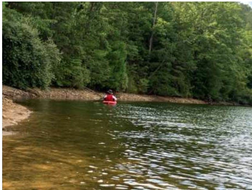
Andy kayaks Long Pine Run Reservoir at Caledonia State Park September 2020