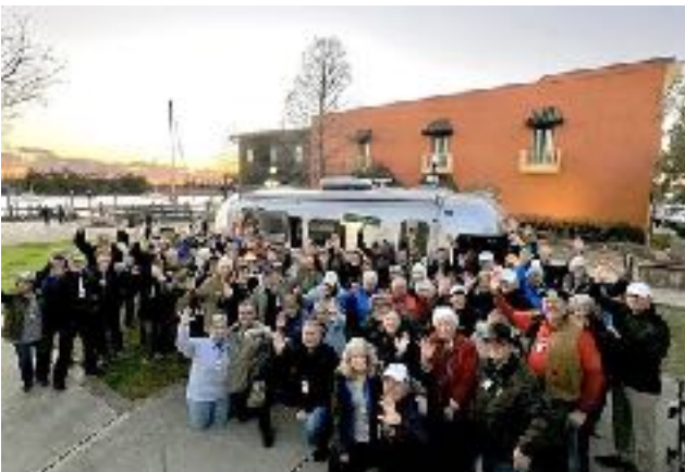
Last days of innocence at the Georgetown SC Silver on the Street

Little did we know what was in store for us! In early March we joined the South Carolina Coastal Airstream Club for a very successful Silver on the Street rally in Georgetown SC. We gathered as a group several times and hosted an afternoon open house session with dozen of folks in very close proximity inside our Flying Cloud 25. Arriving home in Virginia on March 10 the alarm bells were beginning to ring worldwide.