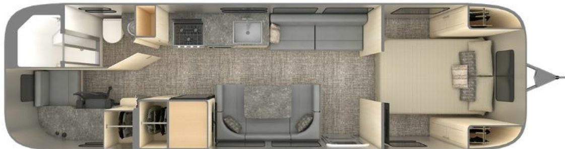
Flying Cloud 30FB Office

Airstreams are not for retirees anymore. Airstream is adapting to the pandemic and beyond by designing a Flying Cloud with an office for remote working, which facilitates ZOOM calls or other video conferencing work and notes with dry erase wall surfaces. Among other amenities. Called the Flying Cloud 30FB Office, it's a $107,500, 6,800 pound, 30-foot trailer with its own separate office area (that can also be used as a bed or nap room after unfolding the "easy chair."). Check out: https://www.seattletimes.com/explore/careers/work-nomading-new-airstream-trailer-comes-with-office-space/ .