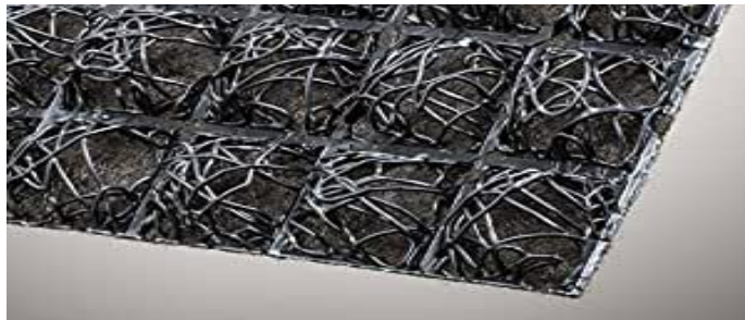
Den-Dry (downside up)

We purchased this item for our short queen and have been pleased with its performance. Den-Dry consists of breathable black felt fabric with rows of black spun polymer bulges attached underneath, looking much like a sheet of black ravioli..