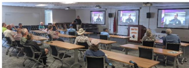
Tour of SORT facility in Mocksville