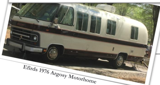
Efirds 1976 Argosy Motorhome