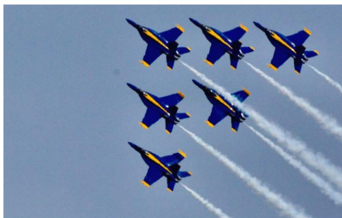
Fort Pickens CG in Gulf Islands National Seashore in Pensacola