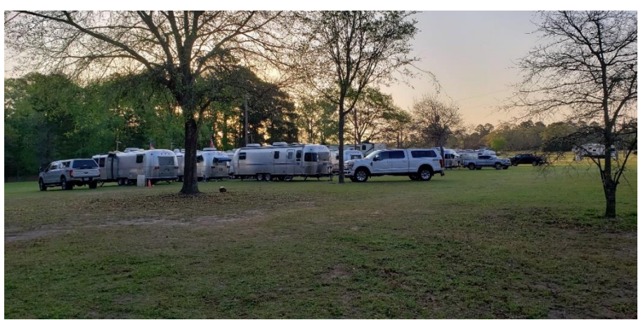
Part of our Airstream club