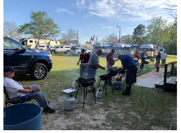
Grilling dinner Saturday evening