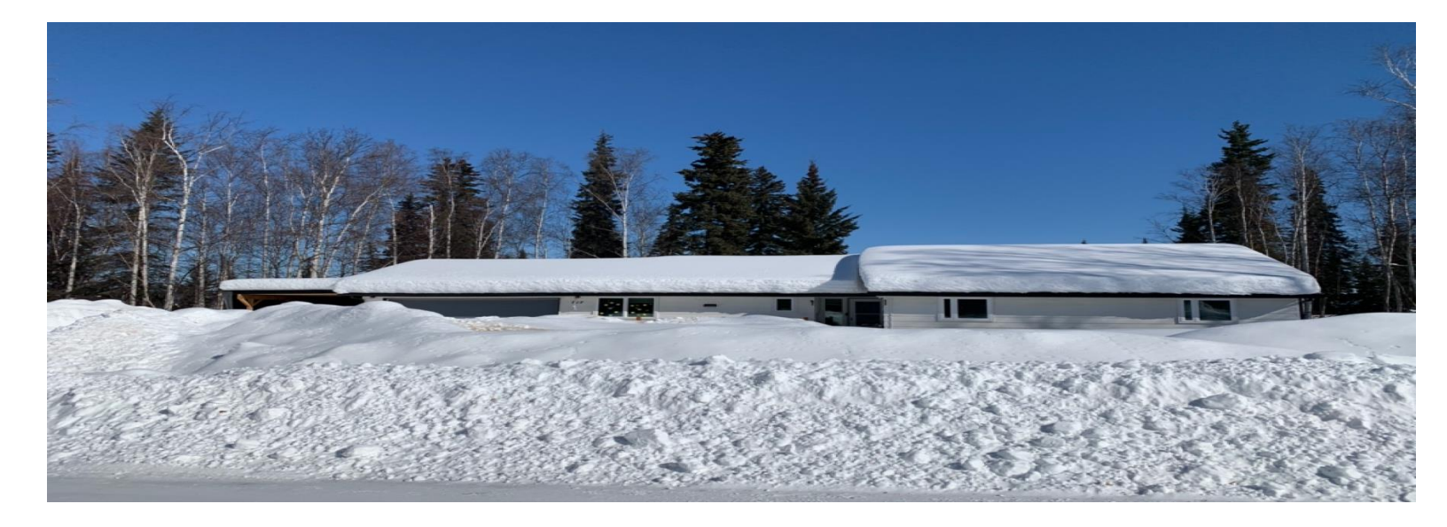
While you were enjoying flowers, I was enjoying snow!