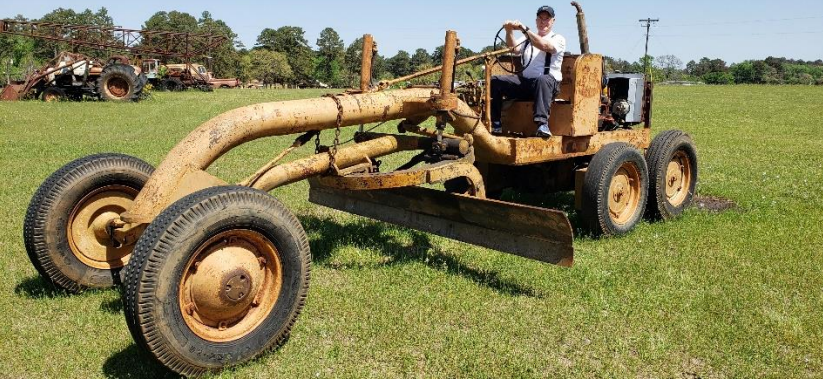
Bruce checking out some of the construction equipment