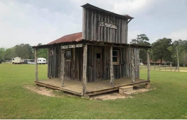
We did have to check our guns in at the Marshall's office