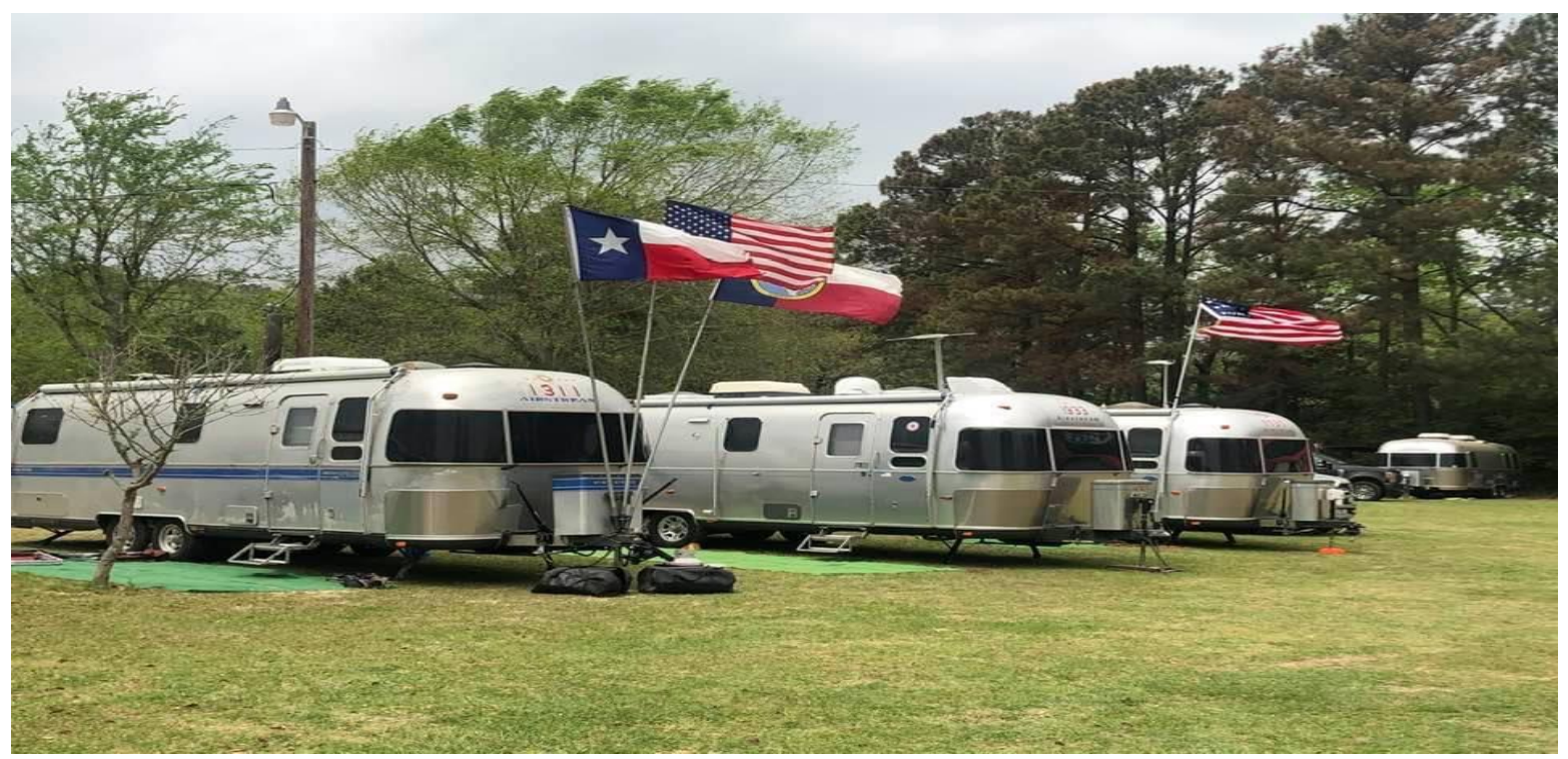
April Rally at Salmon Lake Park, Grapeland, Texas