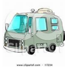
2ND VICE PRESIDENT Needed