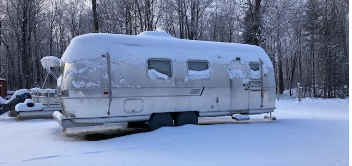
Keith and Sheila Depre - Aurora, our 1971 Overlander, patiently waiting for warmer days.