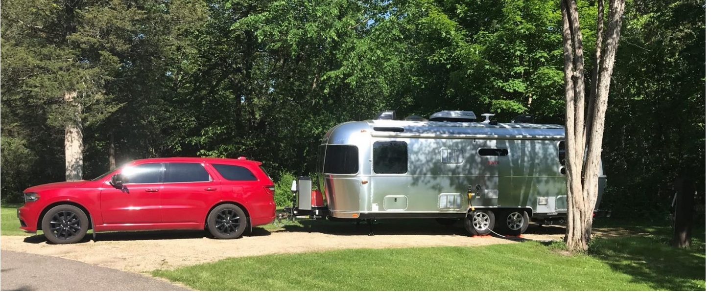
Jeff Janacek & Sally Colwell - Cottage Grove, MN