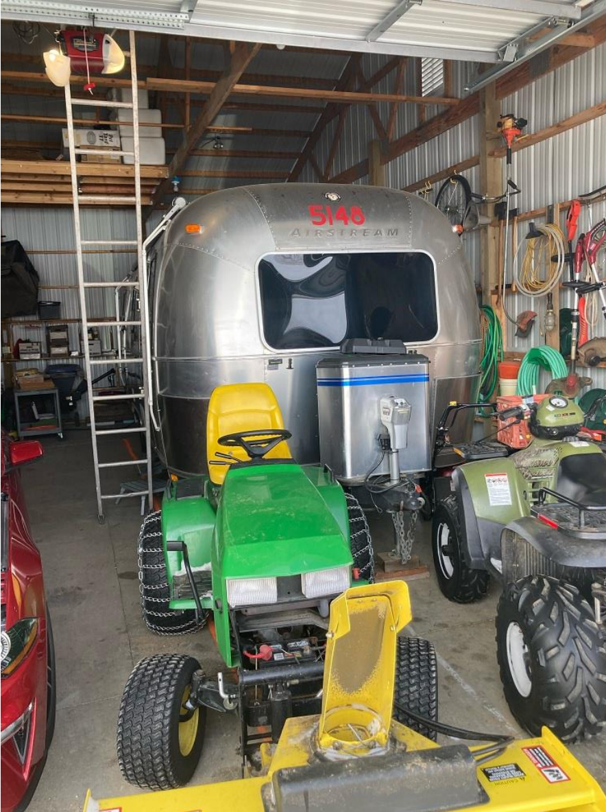
Cordell Woods - Tucked in nice and cozy for the winter.