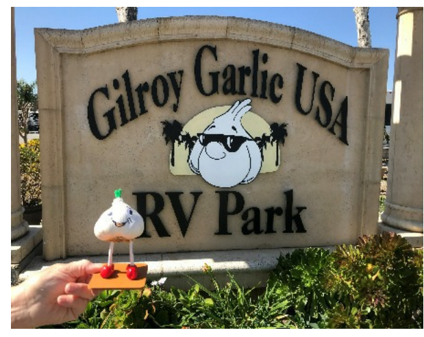
Gilroy Garlic USA RV Park with garlic mascot, Gilly

pandemic restriction guidelines were relaxed in Santa Clara county and all of the participating members had been immunized. So we could enjoy outdoor meetings together without masks, but still avoided group events and indoor gatherings.