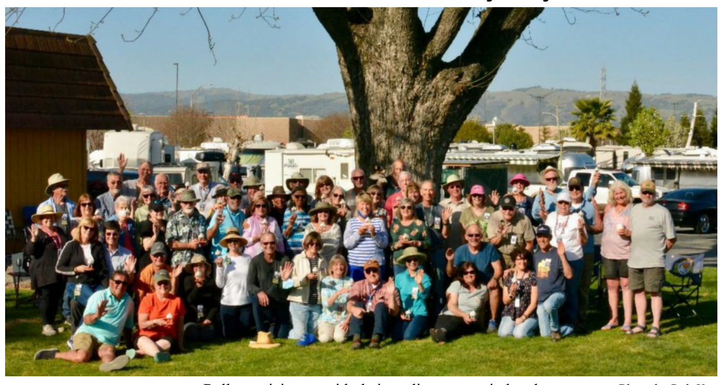
Rally participants with their garlic mascots in hand