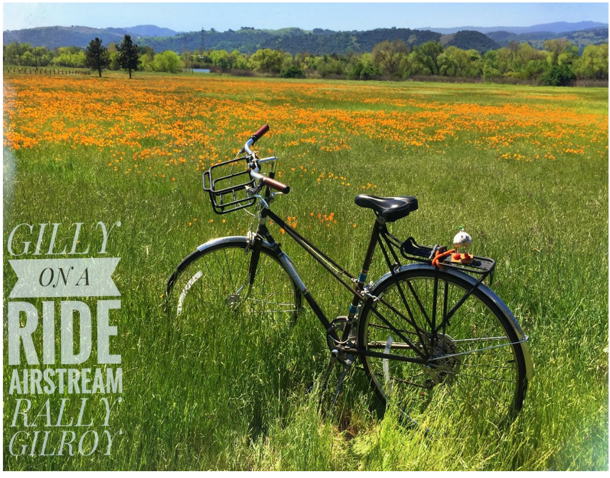
Bicycle with garlic mascot, Gilly and California Poppy field

The Northern California Airstream Club held its first rally of 2021 in April at the Garlic Capitol of the World, Gilroy, CA. Some 30 units made the reservation list with several more on the wait list, so we had a full house. Fortunately, the CDC and state