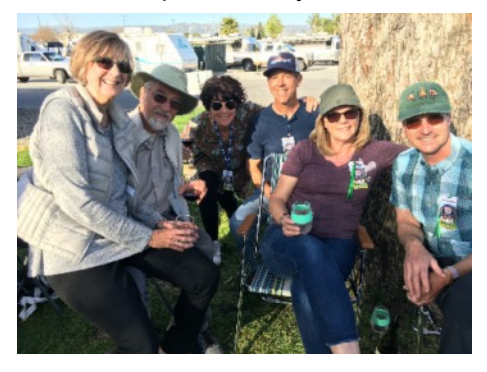
Smiles during Happy Hour