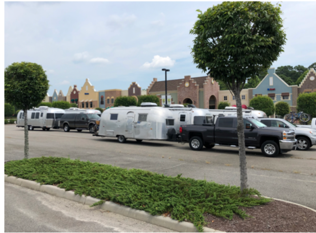
Marshaling to caravan to the International