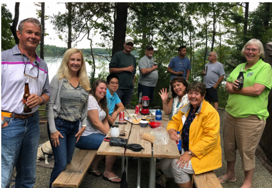
Happy Hour at Rudds Creek