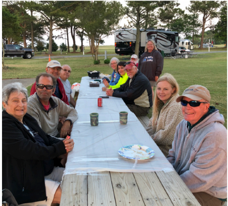
Happy campers at Ft Monroe!

Union General Butler who defined run-away slaves as “contraband”,