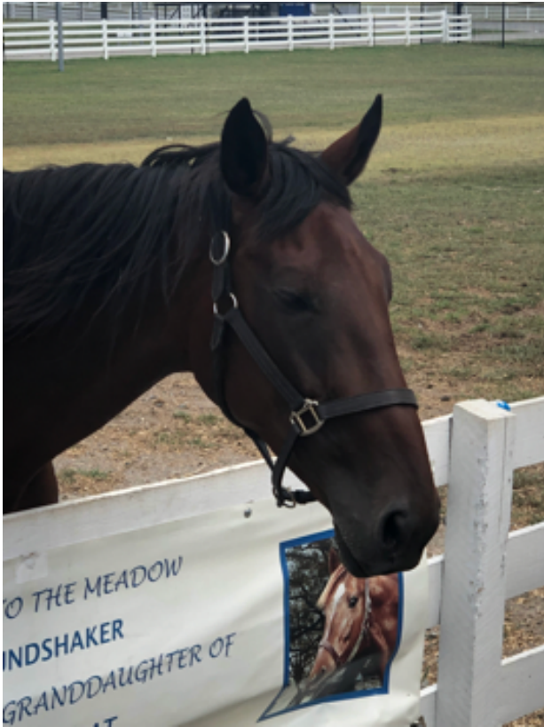
Secretariat's granddaughter Groundshaker