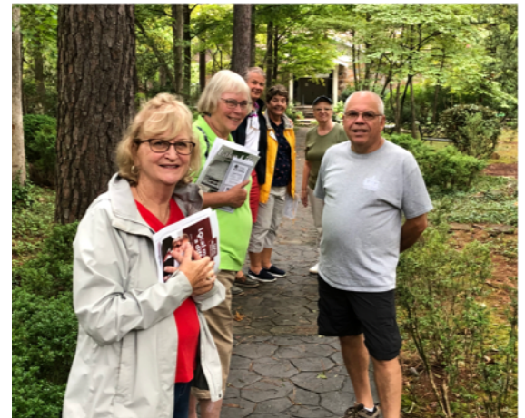
Visit to McCallum Museum