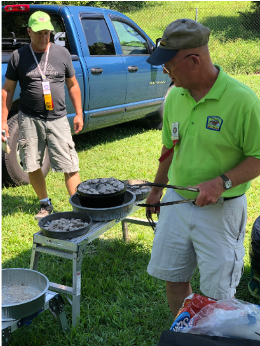
Dutch oven cooking demonstration

Wow, what can I say? This was our first International rally!! Where do I begin? I'm so glad we went ... we really didn't know what to expect. We rendezvous-ed in Williamsburg with 5 other Airstreams from our