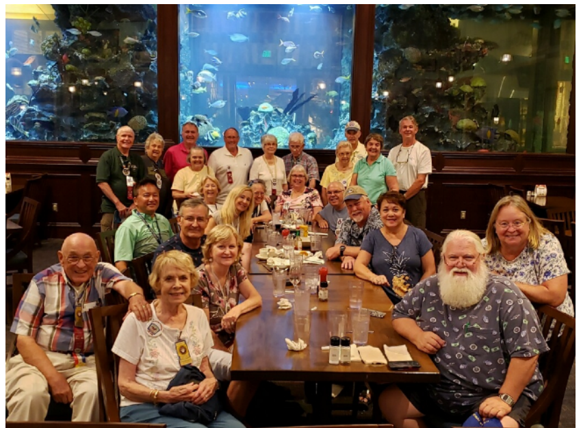
Our Tidewater Club was well represented!