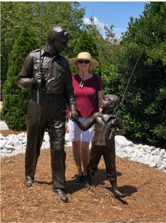
A visit with Andy and Opie