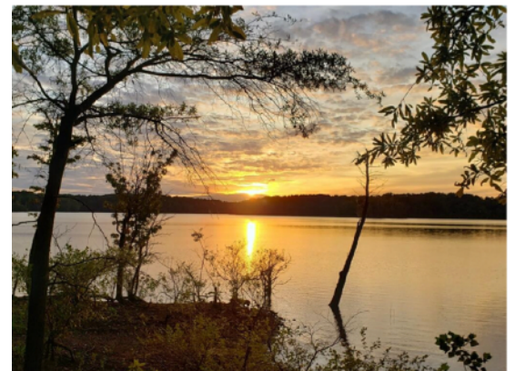
Sunset over Rudds Creek