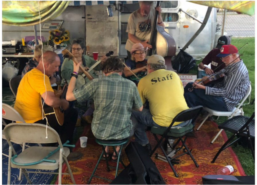
Airstreamers Jamming in Felts Park