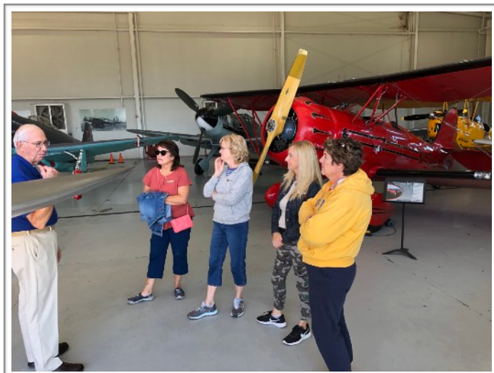
Touring the WWII hangar

addition to aircraft, the museum houses many artifacts and art from these periods. We were treated to an impressive 2 1/2 hour private tour of the collection by one of the museum’s expert docents. He took us through four buildings containing incredible examples of World War I and II airplanes and related items. If you are an aviation buff or interested in history this museum is a must see!