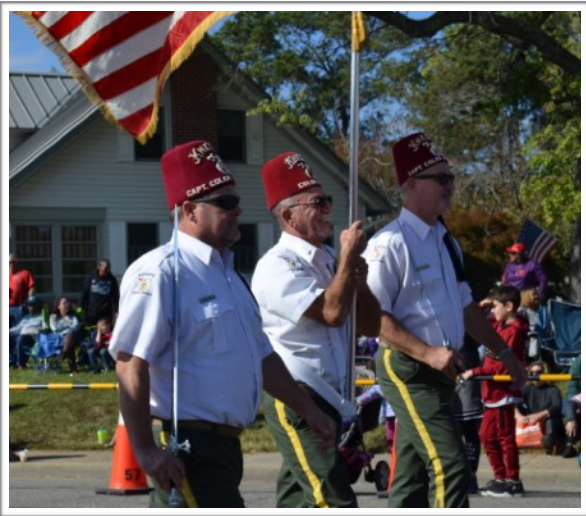
Proud Shriners pass in review