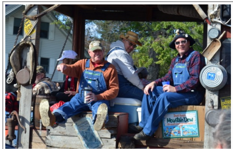
Shriner hillbilly band float