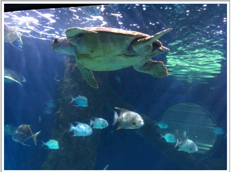
A majestic sea turtle