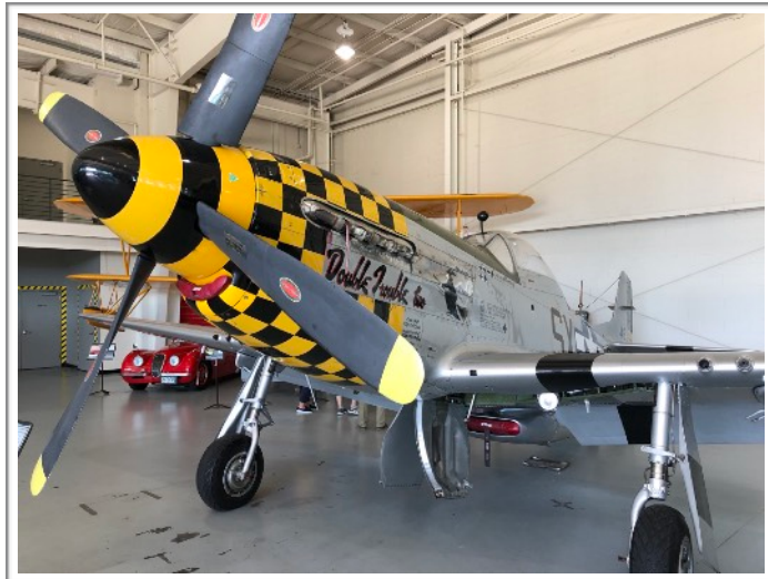
P-51 Mustang “Double Trouble Two”