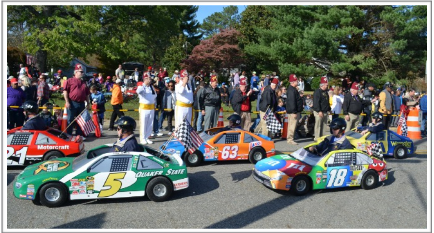
Every grown man's dream - to drive one of these!