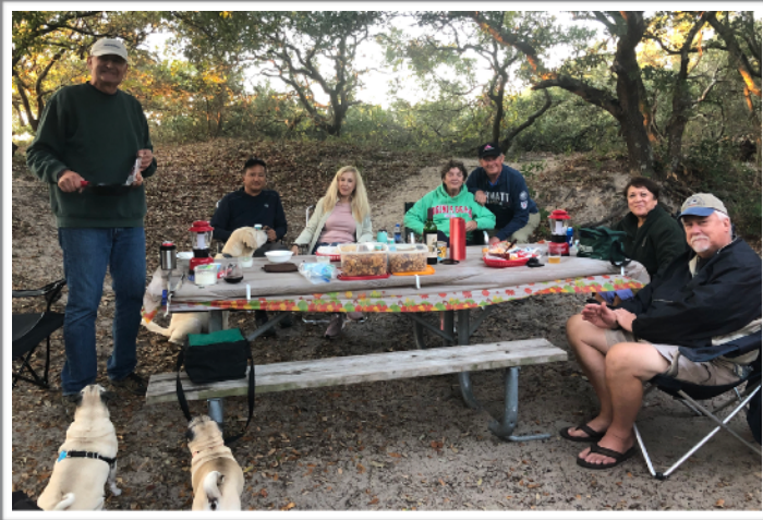
Happy Hour at the beach