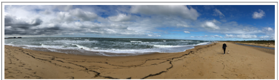
First Landing Beach