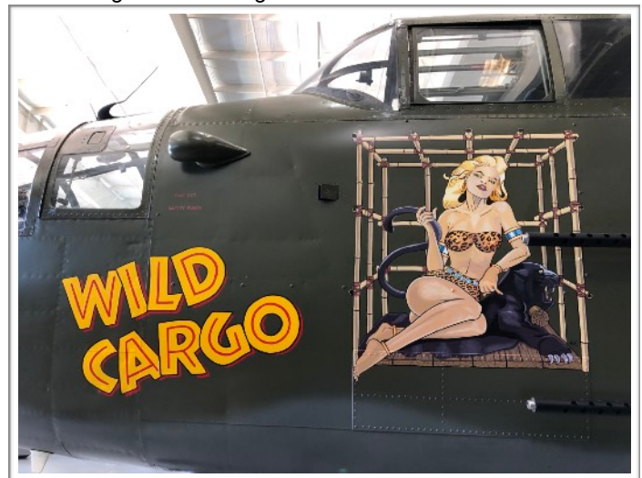
WWII Aviation Art