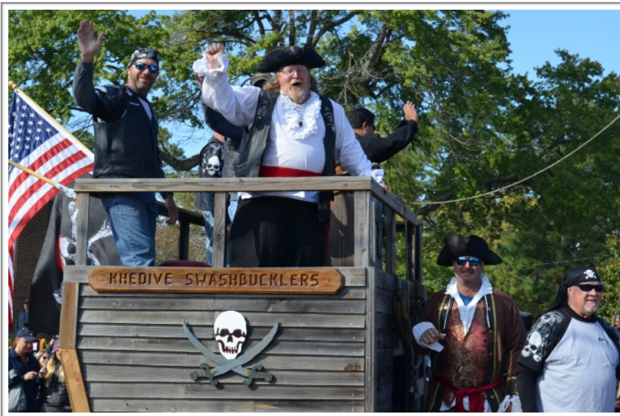
Argh - take me to the oysters!