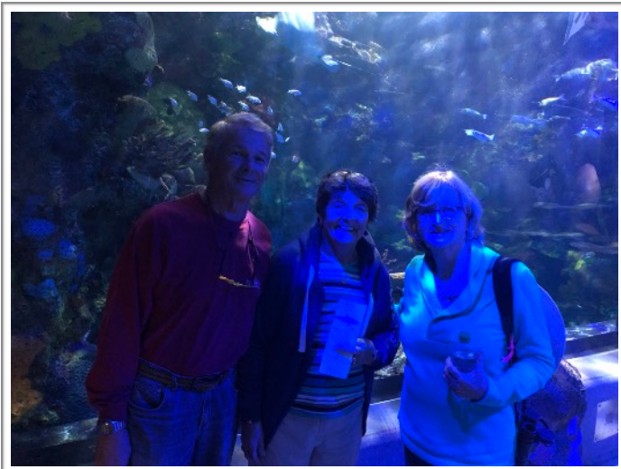
Scary! Touring the aquarium