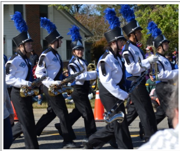
Local high school band