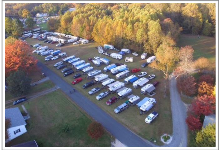
Urbanna parking (file photo)