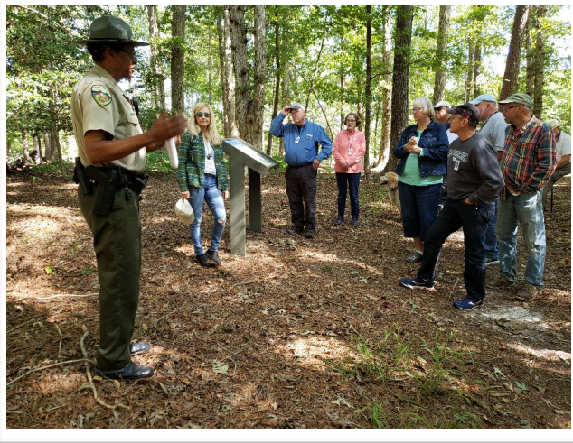
Guided ranger walk