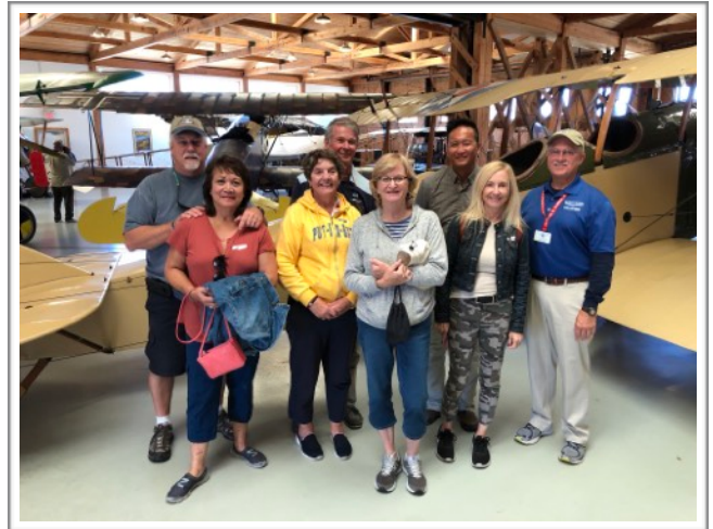
Touring the WWI hangar

On Friday, we visited the Military Aviation Museum ( https://militaryaviationmuseum.org ) in Pungo, the home to one of the world’s largest private collections of fully restored and flyable World War I and II aircraft. In