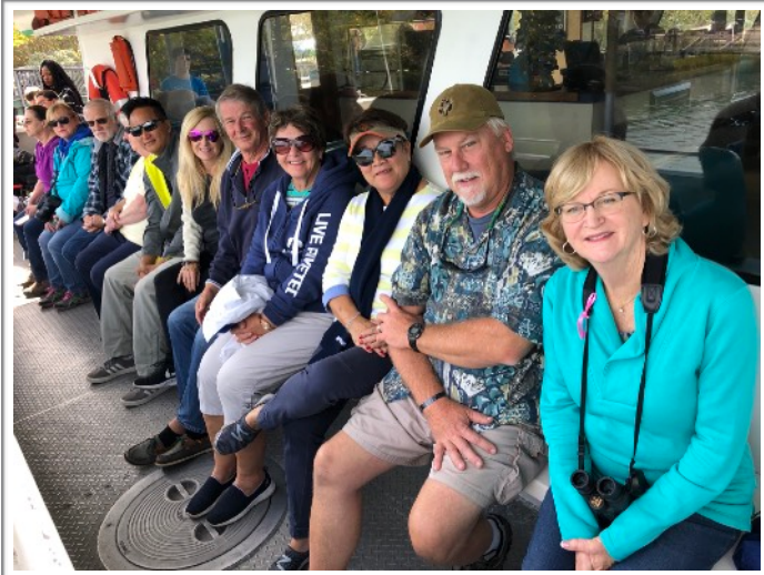
Ready to get underway on our dolphin trip

was perfect and the seas were calm which allowed us to view lots of dolphins and the beautiful Virginia Beach waterfront. The Aquarium also conducts great whale watching boat trips from late November through March. In addition to the boat trips the museum houses a fine collection of local aquatic species as well as other exhibits.