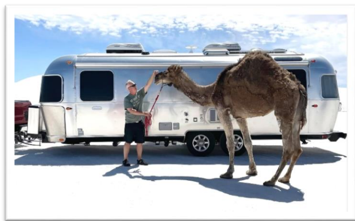
White Sands National Park, New Mexico