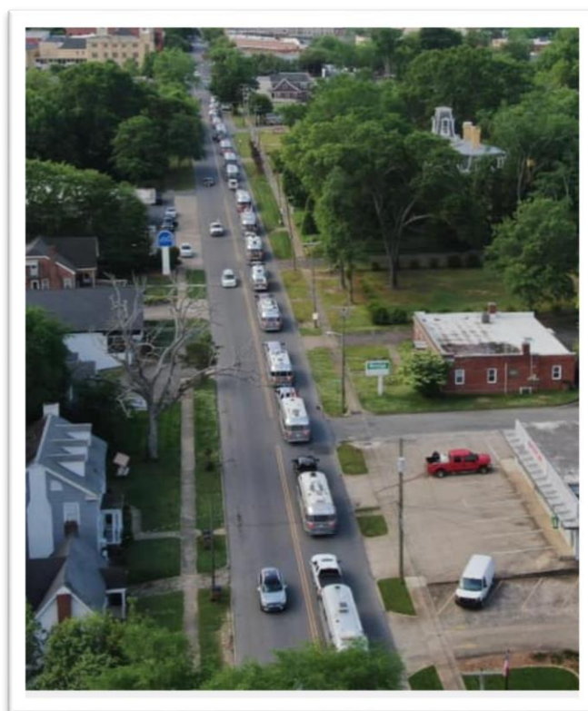
Parading into Uptown Shelby, NC for the 1st Annual Shining in Shelby” uptown rally!

Read the article in the Shelby Star newspaper