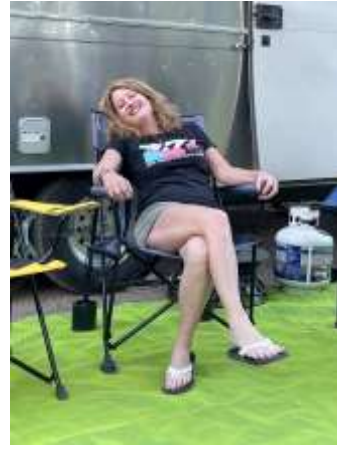
Rocking Chair Challenge