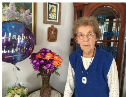
My Mom at 92 on November 23rd and the snow storm from Mom's porch on Main Street.