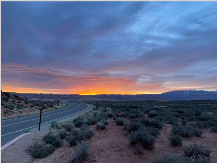
Sunset in Arches NP & The 3 Gossips

In no particular order are some photos to remind us of all this fun