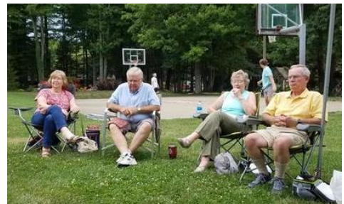
August picnic – Burkholders & Todds

The Region Rally & The International Rally