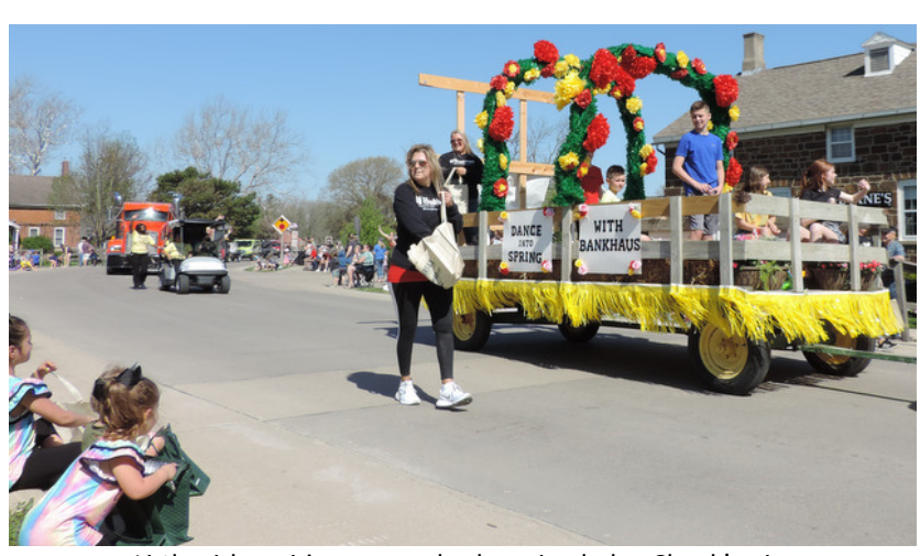
Little girls waiting on candy-throwing lady.