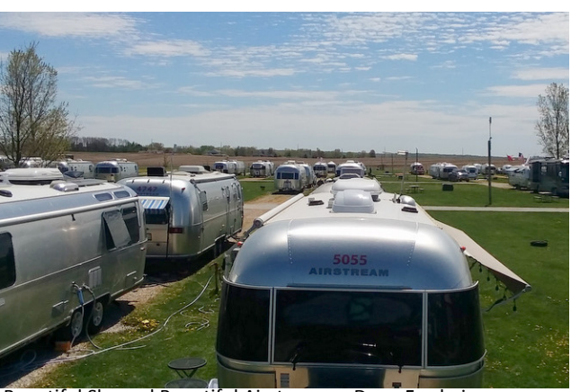
Beautiful Sky and Beautiful Airstreams.