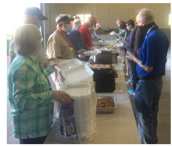
Friday supper food line.

Although the rally was somewhat different from past rallies, everyone still had an enjoyable time and it was