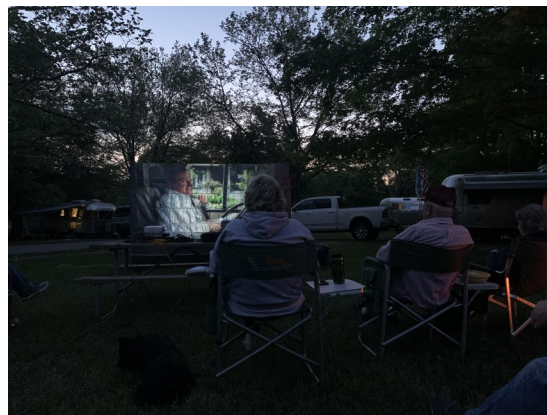
If you didn't make this event, more rallies are on the docket this season!! SO, get on board to enjoy the outdoor activities.