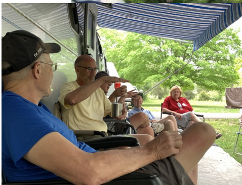
And we never have a problem figuring out how to end the day!!! Refreshments and a movie.