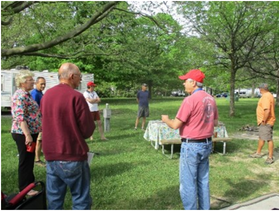
We had our morning Standup Business meeting while being socially distanced.