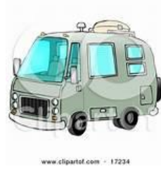
2ND VICE PRESIDENT Vote on Nov.19, 2021