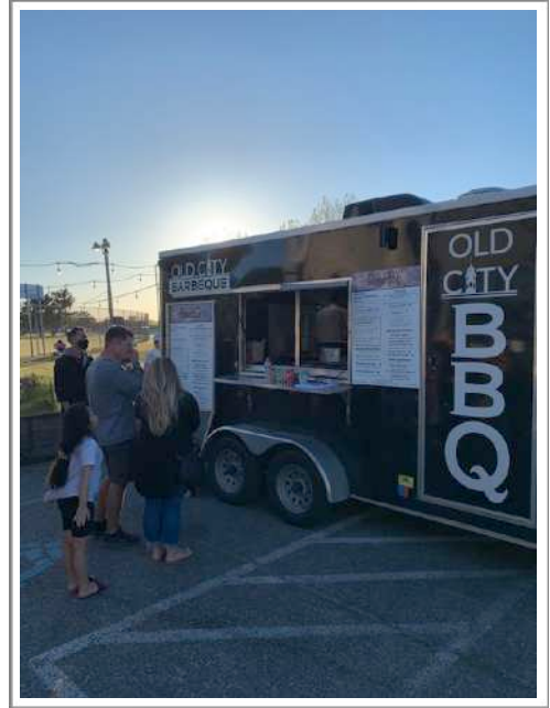
Submitted by Jayne Munoz