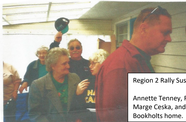
Region 2 Rally Sussex County Fairgrounds