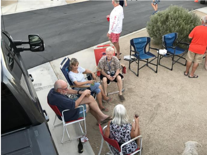
An interesting perspective on happy hour.