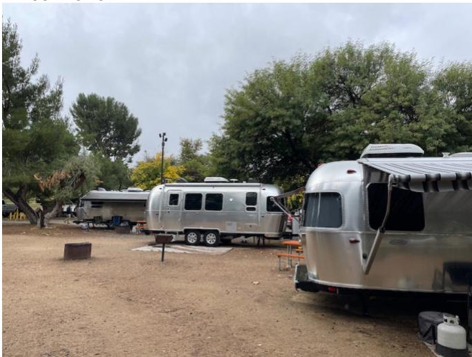
Three in a row.