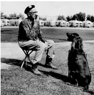
Left: Wally Byam with his dog Chica at the 1957 Palm Springs Airstream Rally.

Airstream, Inc. offered a narrow window of opportunity back in December to stream the movie for $11. If you missed this chance, you might have to wait until the Newport Beach Film Festival to catch it later this year. You can see the trailer at https://www.aluminummovie.com/trailer . Perhaps the streaming offer will come up again so keep an eye out.