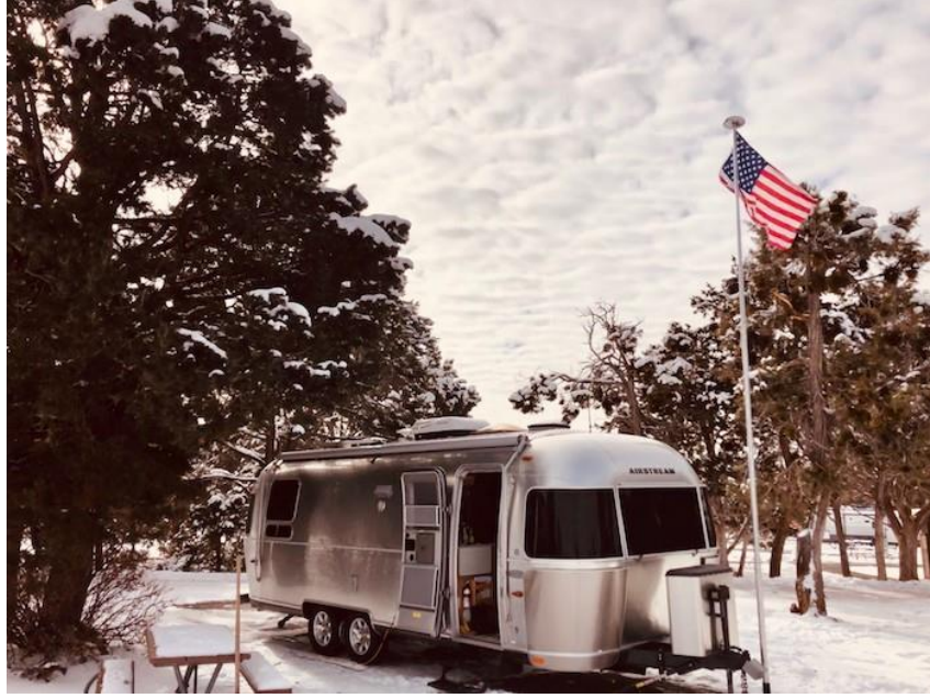
The Airstream at the Grand Canyon