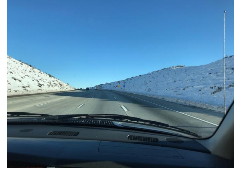
The Cajon Pass