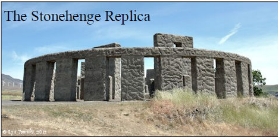
The Stonehenge Replica

Our last caravan move and stop before Salem we traveled on to Maryhill State Park, near Goldendale, WA. This stop was Friday to Wednesday morning. There were many things to see and do there, Maryhill Museum, a Stonehenge Replica, the Dalls Dam and locks, Mt. St. Helen, waterfalls and other scenic venues. Fresh fruit was abundant at roadside stands and enjoyed by all. Everyone was free to tour as they wished.