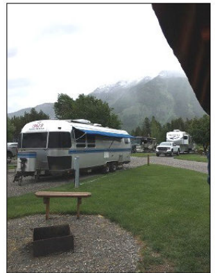
Camp at West Glacier

Friday the 8th found us at the delightful West Glacier KOA. Paved sites and full hookups. Mountains all around and we awoke to a healthy skiff of snow on the upper reaches of those mountains. Saturday and Sunday free to tour and see what we could. Going to the Sun Highway was still closed by snow and the area had much road construction/ improvements going on. This was a lovely place to camp with a store and café. Bought some Huckleberry Dark Chocolate bars here. Happy hour get-togethers continued on a daily basis and at a previous nights "movin' on" drivers meeting Pat had challenged us to look for unusual sights along the way each day – like the fence made of cable spool ends – ranch entrance road signs, a big coffeepot shaped – yep – coffee stop! We would then describe/discuss the days sightings at our evening driver meeting. As we had moved on across Montana it was again pretty flat terrain with far vistas, but as we neared Glacier area the mountains began to loom in the distance, and we would soon be traveling in/through those mountains.