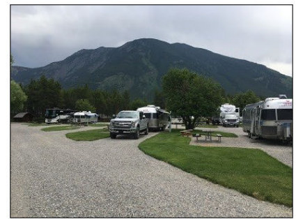
Hell's Canton RV Resort and Marina

Tuesday the 12th found us moving to Clarkston, WA. At this point en-route we left US 2 for good. Hells Canyon RV Resort and Marina is in the bank of the Snake River – and a beautiful view from camp. Again we enjoyed paved pull throughs with full hook ups and excellent weather. This stop was Tuesday, Wednesday and Thursday nights. Happy Hour Tuesday, a Jet Boat trip up the Snake River, including lunch, Wednesday