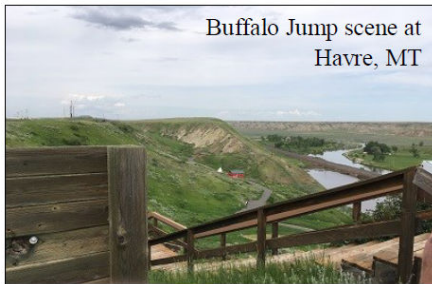
Buffalo Jump scene at Havre, MT