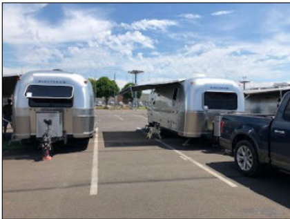
Typical campsites at WBCCI 61st International Rally