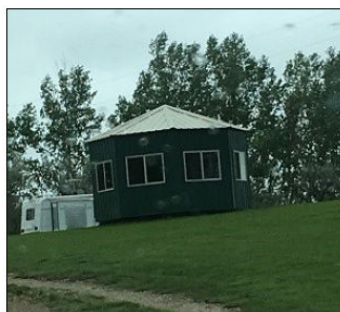
“Doomsday Bunker” at the Haven near Harvey

Thursday, we traveled onward to Grand Forks, ND – Grand Forks Campground. A very pleasant camp but at the end of a mile of bumpy road. Here we enjoyed happy hour followed by dinner on our own. Again, the scenery was typical way upper Midwest with more Lakes!