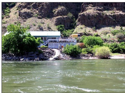
Cliff formations on the Snake River

Our stay at West Glacier done, we moved on Monday the 11th through Bonners Ferry, ID to Blue Lake RV Resort near Naples, ID. Here we enjoyed a happy hour/grill out dinner in their "café" facility – a nice room where one could purchase wine, beer or soda and included use of their grill and tables for our dinner. A very pleasant camping experience. This part of Idaho is quite mountainous and interesting driving.