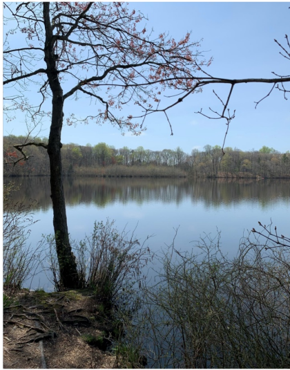
Buds break at Killens Pond on a beautiful April Day.