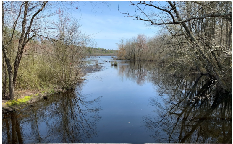
View from the bridge along the Killens Pond hiking trail