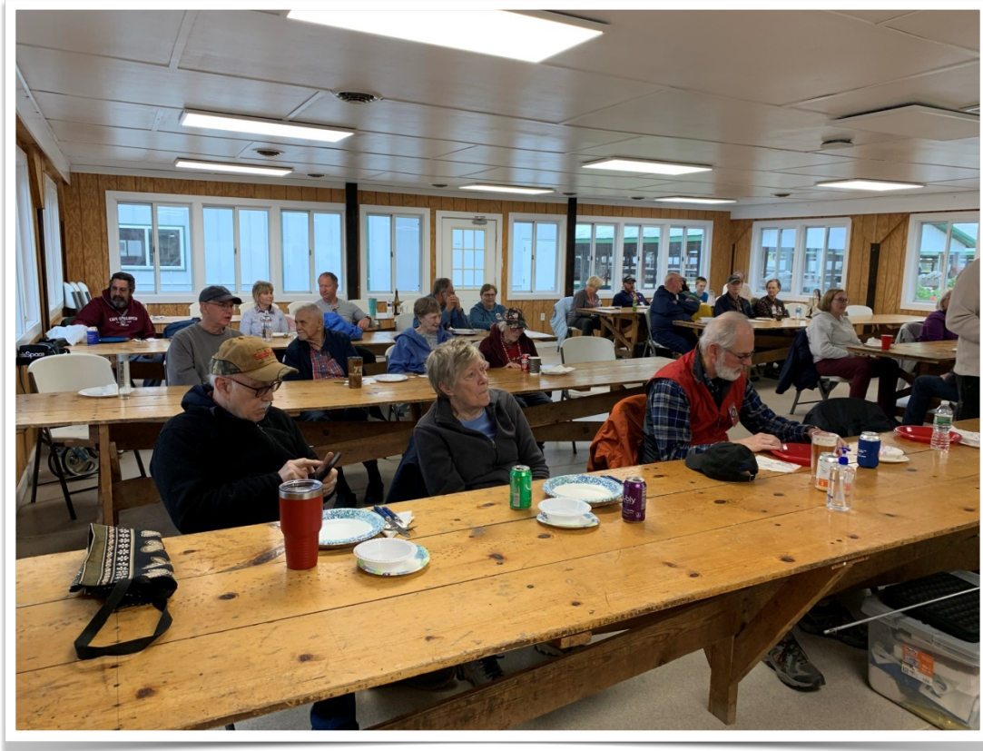
Attendees await their chance to join the buffet line.