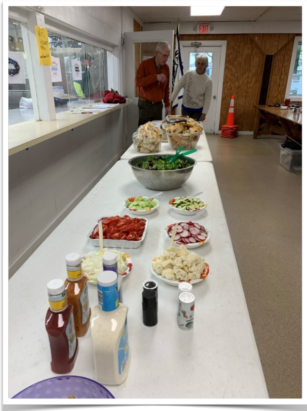
A terrific meal was prepared and served.