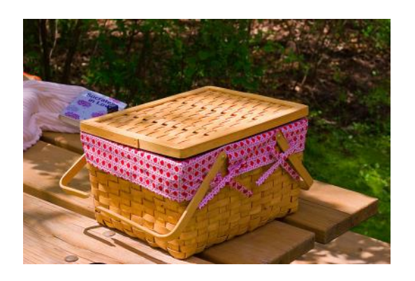
JULY PICNIC July 31, 2021