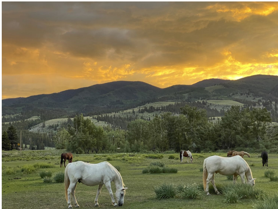
Cottonwood Cove RV Park – Creede