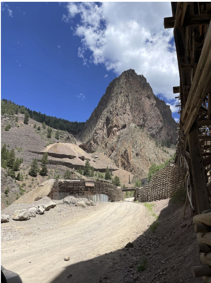
Bachelor Mine Loop