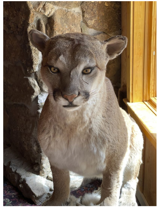
Seen at Blue Creek Lodge