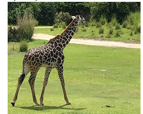
Page | 1

Publication of the Watchung NJ Airstream Club July 2021