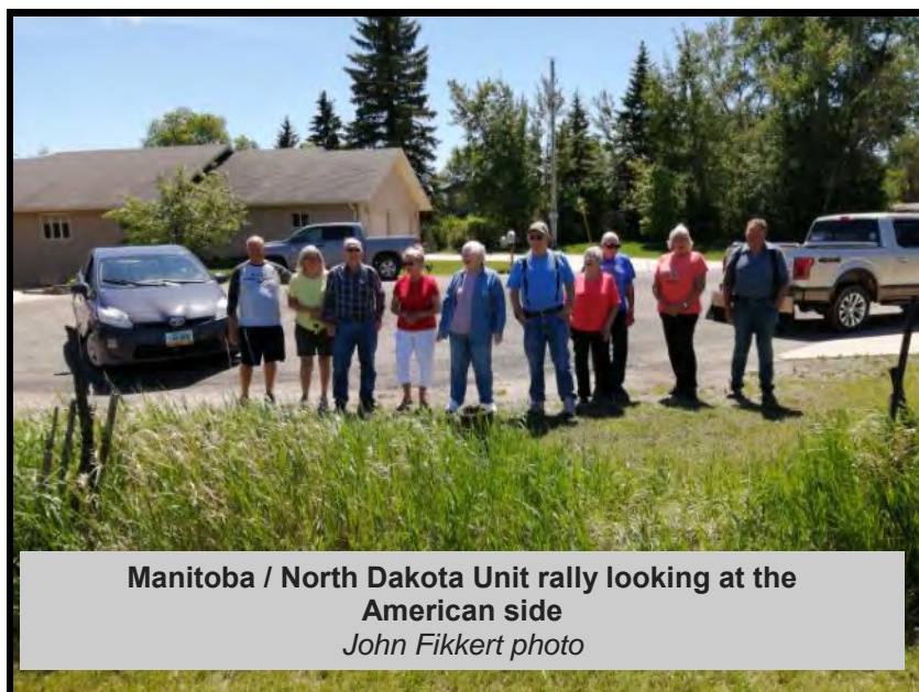
Manitoba / North Dakota Unit rally looking at the American side