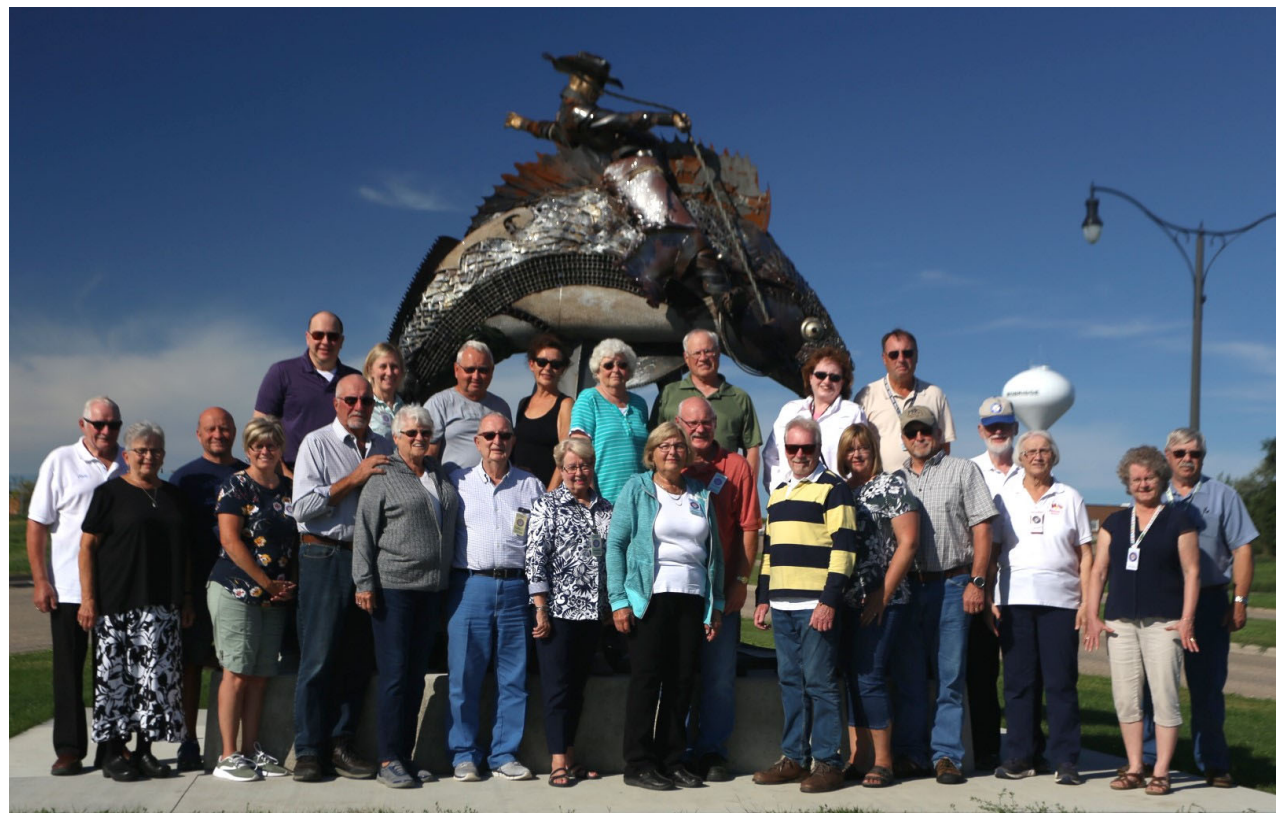
"Walleye Up" in Mobridge, ND