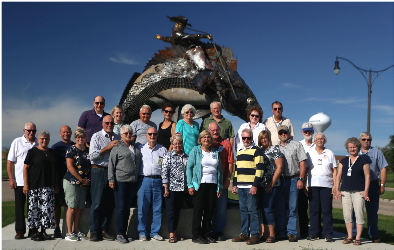
"Walleye Up" in Mobridge, ND

January - February 2020 Volume 18 Issue 1