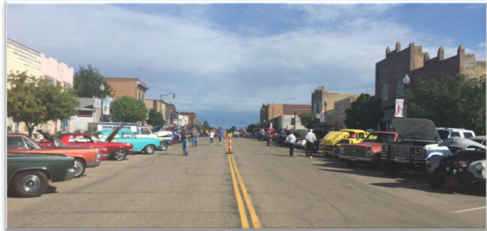
Beef N Fun Weekend Car Show

The end of another season of NDPG Unit Rallies and looking forward to 2020 rallies. A great opportunity to camp with friends, enjoy great food and tour the NDPG Unit’s prairie.