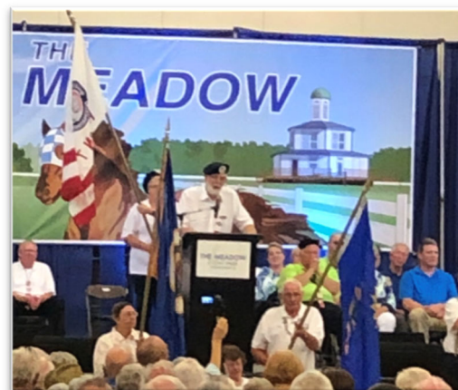
Rolly carrying NDPG Unit Flag