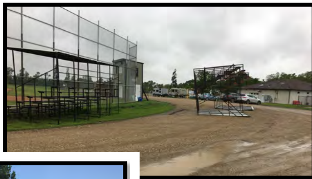
Topsy Turvy Bleachers!