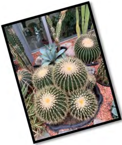
Cactus at the Conservatory & Interpretive Center - International Peace Garden

The Canadian members extended their stay and went on their merry way on Monday.