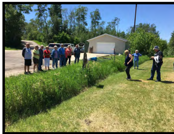
Cross Border Visit