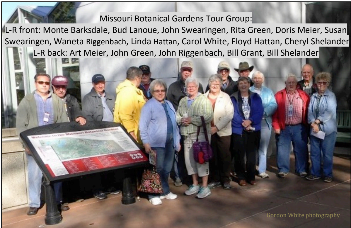
Missouri Botanical Gardens Tour Group: