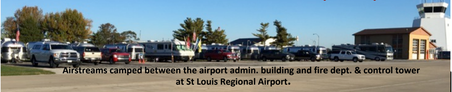
Airstreams camped between the airport admin. building and fire dept. & control tower at St Louis Regional Airport.