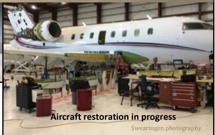
Aircraft restoration in progress