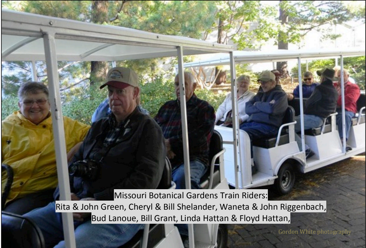
Missouri Botanical Gardens Train Riders: