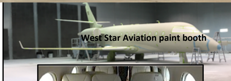
West Star Aviation paint booth