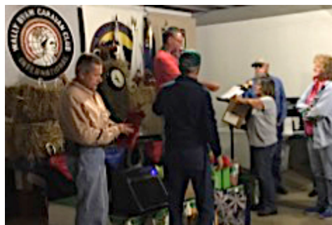
Monte passing out door prizes.