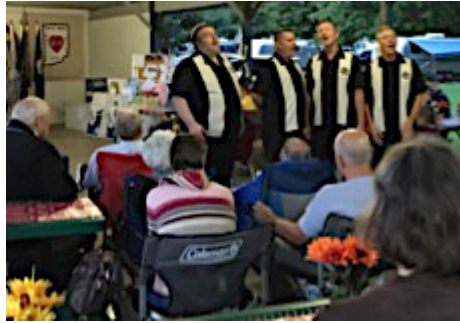
Barbershop Quartet "Those 4 Guys" evening entertainment.