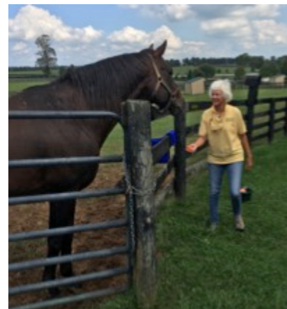
Tour guide with Touch of Gold who won 1997 Belmont Stakes denying Silver Charm the Triple Crown.

Region 5 President Artie Martin & First Lady Pam planned & executed a wonderful rally, located at the Kentucky Horse Park Campground, Lexington, KY. The Horse Park is a working horse farm and educational theme park. Activities included a fascinating tour of Georgetown Toyota Camry factory, an up close & personal tour of Old Friends Horse Farm, a splendid outdoors evening catered dinner at the Horse Park Museum, and 1-day admission to the Horse Park attractions. Illinois Lincolnland Unit members prepared & served the Friday morning biscuits & sausage gravy breakfast.