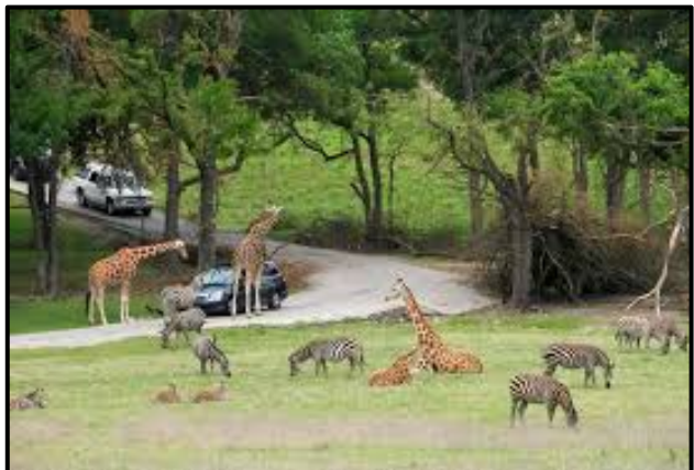
Fossil Rim Wildlife Park