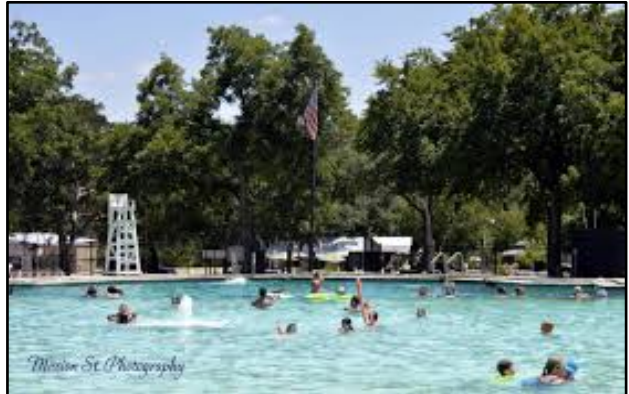
Oakdale RV Park