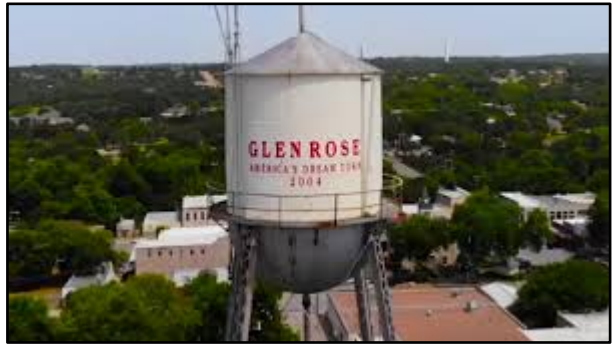
City of Glenrose