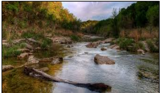
Dinosaur Valley State park