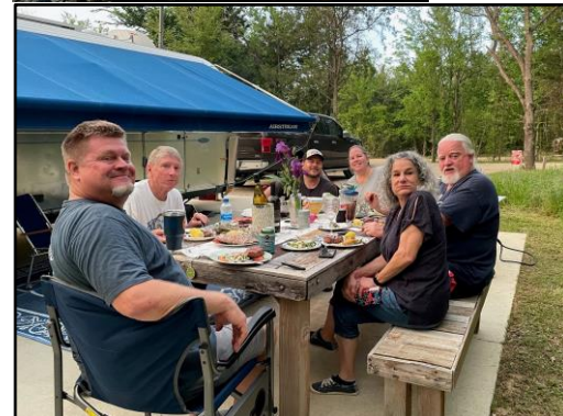
All gathered at the Brandon's site for a fabulous steak dinner!