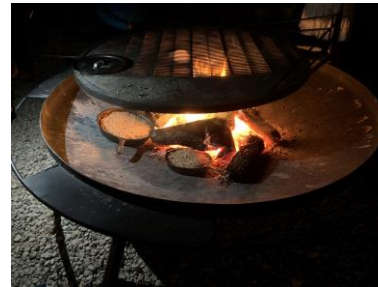
Peach-Blackberry Cobbler in the big campfire.