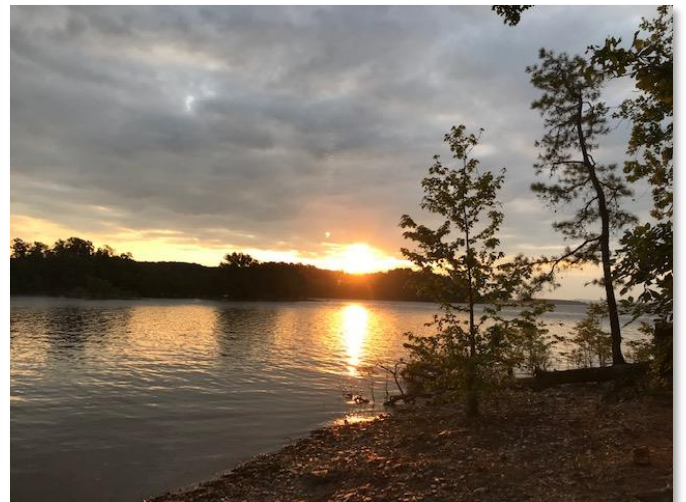
Sunset on Ouachita Lake

The morning after the wedding! The occupants are still sleeping!