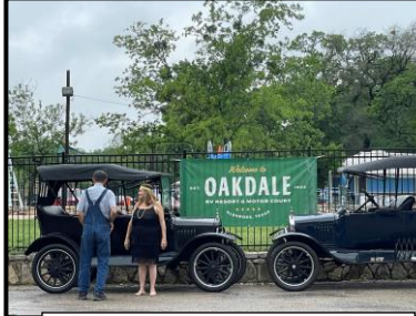
Back to the Roaring 20's

Despite the weather, everyone had a great time meeting new people and doing an open house of vintage trailers.