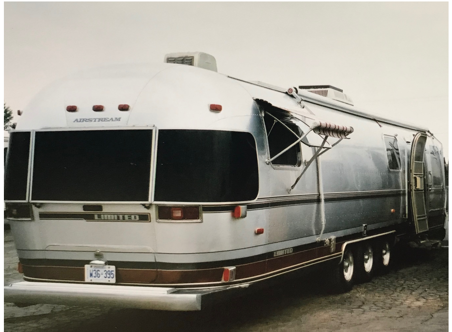
Our first of the 5 "switcheroo" adventures.