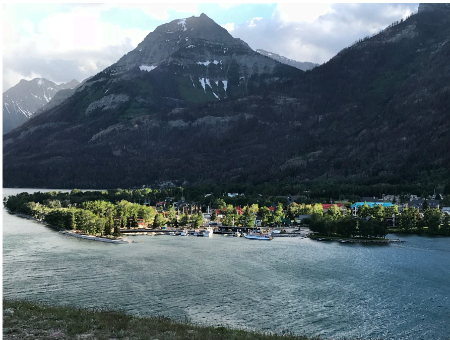
Waterton Lakes National Park "Salem Eh" Caravan 2018