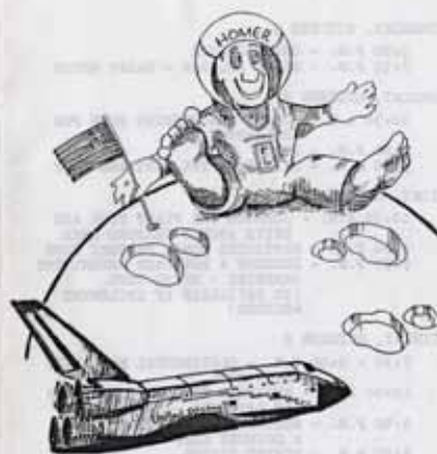
TWENTY-FOURTH ANNUAL BUSINESS MEETING AND INSTALLATION BANQUET DELMARVA UNIT, WBCCI OCTOBER, 1988 SCROPTIST PARK SEAFORD, DE