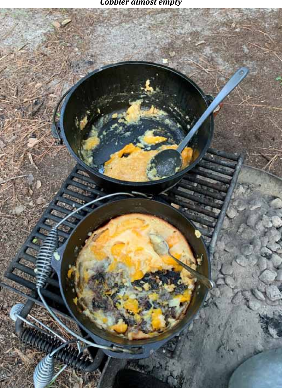
Cobbler almost empty

On the evening of the 4^{th} , two pots of peach cobbler were cooked in cast iron over the fire. Not bad for novices! Ice cream was available to cool the warm gooey peach goodness. There was enough to share with rally attendees --plus several other lucky campsite neighbors. Sparklers and glow sticks lit up the night.