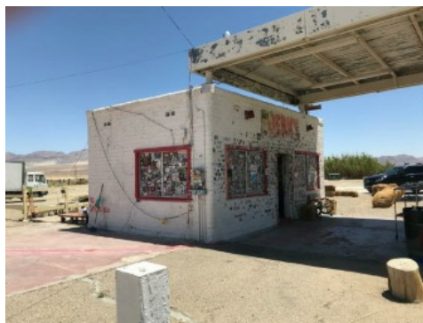
Beef jerky store in Olancha

A bit further south of Lone Pine we stopped in at a well advertised beef jerky store (a re-utilized abandoned gas station). We found the beef jerky to be priced at $15 for three ounces (they must have used wagyu) so we passed the opportunity to try it. (At Trader Joes you can buy 4 ounces for 5 or 6 dollars.) Also nearby was a lemon house – rather unique.