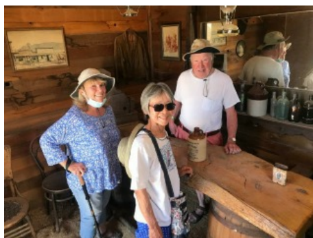
An old tavern bar at the Laws Railroad Museum

To avoid the heat wave, we decided to head north to a higher elevation at Mammoth Lakes near Mammoth Mountain and stayed in the Mammoth Lakes resort area. There are several small lakes in the area that are good for fishing and boating recreation and there are miles of hiking and biking trails. We drove over Mammoth Mountain where there is a large ski resort that is usually open for skiing through May.