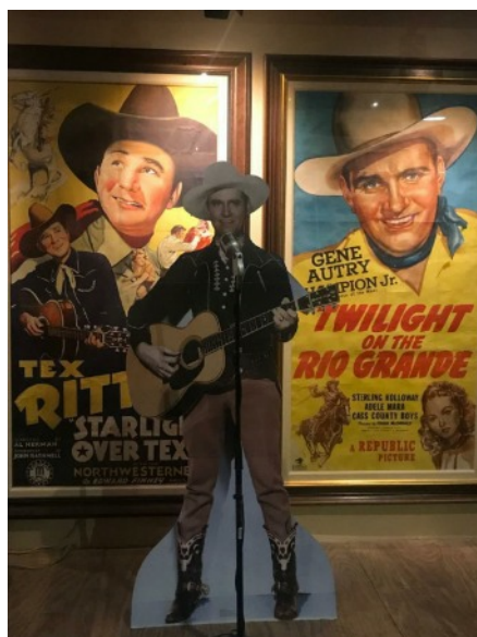
Lone Pine Movie Museum

In the town of Lone Pine we visited the Movie Museum which had just recently reopened after being closed due to the pandemic. Many western movies were filmed in the Alabama Hills including those featuring The Lone Ranger, Gene Autry, Tom Mix, Roy Rogers, Hopalong Cassidy, Humphrey Bogart, etc., etc. More recently the setting was used for science fiction films.