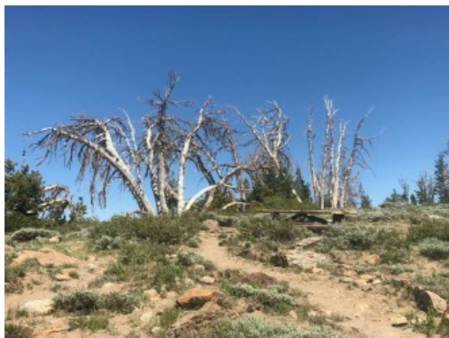
Near Devils Postpile entrance

Past the resort is the entrance to the Devils Postpile National Monument, which features large hexagonal columns of basalt that resulted from a volcanic lava flow a long time ago. The road to the Postpile was closed until mid July so we could not visit. But there were nice views from the entrance area.