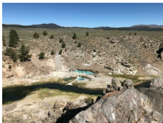
Hot Creek - Geothermal area

On the eastern side of US 395 is a geothermal area with several natural hot springs. One of the most popular ones is located on the edge of Hot Creek.