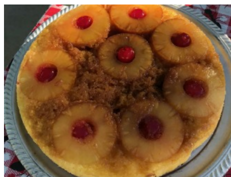
Carole's Pineapple upside down cake for desert

We returned home a couple of days earlier than planned in order to get away from the heat (and the air conditioner on one of the Airstream trailers had quit working). But we had a great time nonetheless.