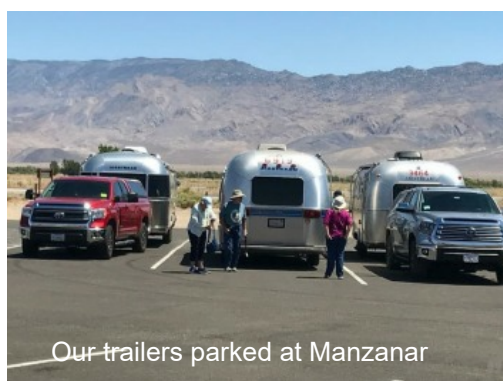
Our trailers parked at Manzanar

Just a bit further down the highway was the town of Lone Pine and the road to Whitney Portal and the Alabama Hills. We had planned to dry camp in the Alabama Hills a few days later but because of an impending heat wave we abandoned that idea. There are no trees in the Alabama Hills, no shade, no water. etc., and the temperature was expected to reach 110 deg F. So we think we made a good choice to drop that idea..