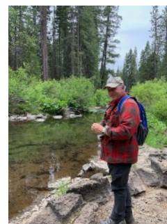
The author getting "skunked"

Besides fishing, some members played golf at the local 9-hole golf course that had been built by the lumber company back in the 1920s. They reported their golf play was so-so but they had fun, hoping to catch a glimpse of the elusive Mount Shasta, which remained shrouded with clouds most of our stay.