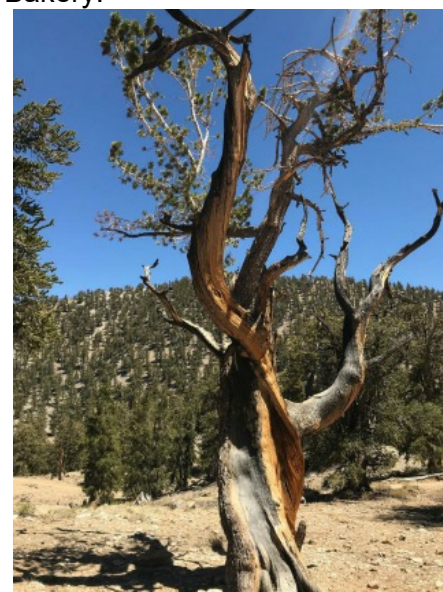
Ancient Bristlecone Pine Tree

We spent four nights in Bishop at the Highlands RV Park and spent another day just exploring around the nearby area. We went to the Keough Hot Springs in the morning and the Laws Railroad Museum in the afternoon followed by having a gelato at Schat's Bakery.