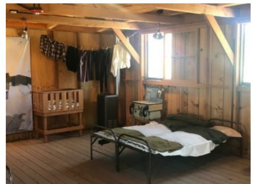
Typical barracks quarters for a family

In 2010/11 some of the barracks were reconstructed so that visitors can see what the living conditions were like during the war years. The reconstructed barracks though are built to today's building codes so that they are safe for visitors and are actually quite nicer than those that were there in the 1940s. Families were allocated small sections in the barracks with cots for beds. The American government was kind enough to provide free straw so that the people could stuff their own mattresses made of sewn together sheets. The visitor center just opened the day that we were there after being closed during the pandemic. So we were among the first to enter it in over a year.