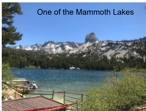
One of the Mammoth Lakes

To avoid the heat wave, we decided to head north to a higher elevation at Mammoth Lakes near Mammoth Mountain and stayed in the Mammoth Lakes resort area. There are several small lakes in the area that are good for fishing and boating recreation and there are miles of hiking and biking trails. We drove over Mammoth Mountain where there is a large ski resort that is usually open for skiing through May.