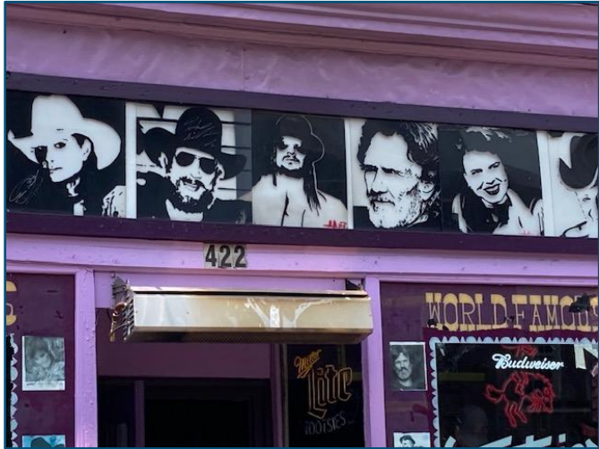
Grand Ole Opry and Broadway Nashville-Willie Nelson's first "discovered" here.