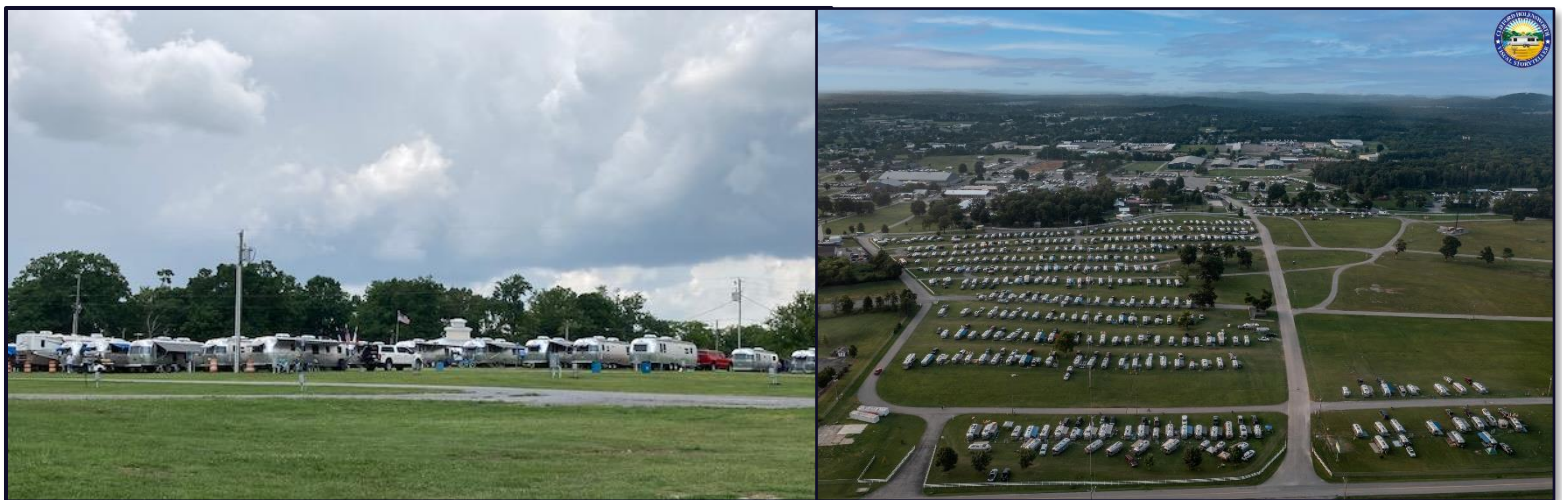
"Field of Streams"