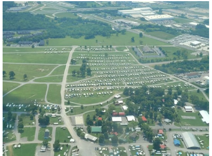
2021 WBCCI International at Wilson County Fairgrounds in Lebanon, TN.