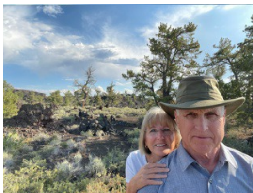
Craters of the Moon Nat. Park, Idaho

In Montana, we visited The Little Bighorn Battle Field. At Idaho Falls, we rode our bikes along the River Walk. Also in Idaho, we went to Craters of the Moon National Park and stopped at Shoshone Falls, which were more of a trickle than a fall.