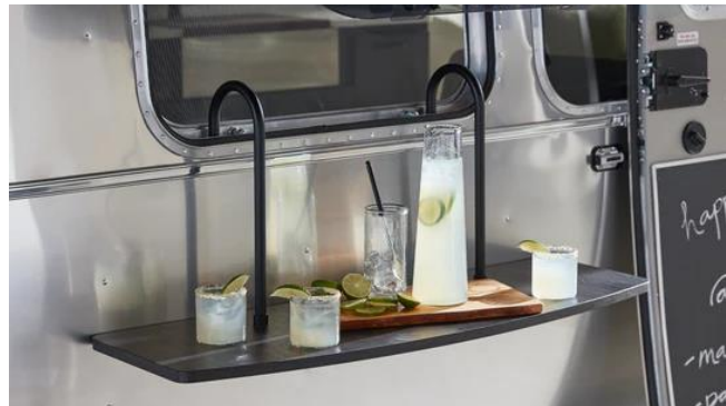
Outdoor hanging table is an Airstream first and provides a spot for cocktails.