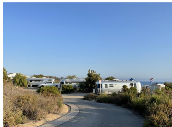
Crystal Cove Moro Campground