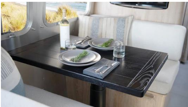
Solid Oak Wood Table for the dinette that converts to a sleeper.

Sources: Airstream.com and Potter, Everett. “Airstream Pottery Barn Special Edition Travel Trailer.” Forbes. August 1, 2021.