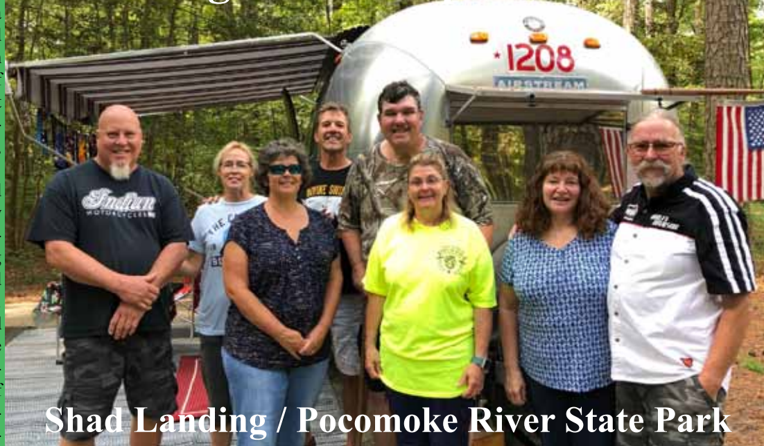
Shad Landing / Pocomoke River State Park

Photos and article courtesy of Roger Sansom