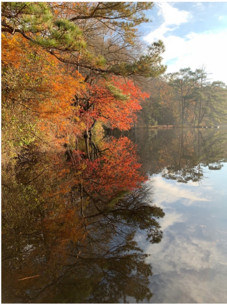
Fall 2018, Trap Pond

plant and tree species and is an excellent fishery for bass and other warm-water fish species. The park boasts nearly nine miles of canoe and kayak trails, and kayaks, canoes, boats and paddle boards are available for rent. A ramp allows boaters to launch and fishing docks are available at multiple locations. Guided tours of the cypress swamp, numerous cemeteries and an 1800s church tell the history of the area. Birders and wildlife watchers can enjoy the plentiful woodlands while more than 12 miles of trails await hikers, bikers and equestrians. The campground features tent and RV sites along with cabins and yurts for a variety of woodland stays. Disc golf, playgrounds, pavilions, a picnic area and two primitive youth camps round out the recreation opportunities. The Bald cypress Nature Center which offers exhibits and interpretive programs about the park's natural and cultural history, is also available for special event rentals.