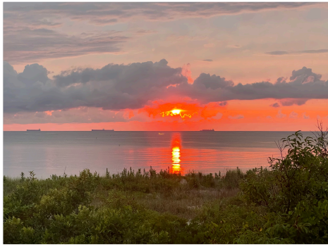
A beautiful sunset of the Chesapeake Bay from the shoreline at Kiptopeke

Is the Airstream your first RV? Yes. This is the first Airstream we have owned.