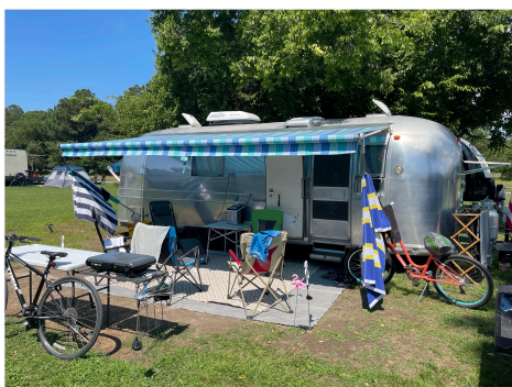
Our little home away from home

Kiptopeke was a lot of fun this time around! We met a nice young couple that full times in a 2016 25ft Airstream. We also got to know our newest members of the club the Engler Family! Over all the trip was fun. If you haven't been to Kiptopeke it is a must visit! The spots are all good size with most having water, electric, and sewer hook ups! Then there is the direct access to a boat launch and two beaches. Finally there is a place you can rent kayaks. Thanks to everyone that showed up it was a great week!