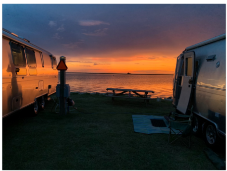
A memory from last year's Crisfield Rally.

Once used as an industrial logging pond starting in the late 1700s, Trap Pond is home to the northern-most, naturally occurring, stand of Bald cypress trees. Trap Pond hosts a high diversity of