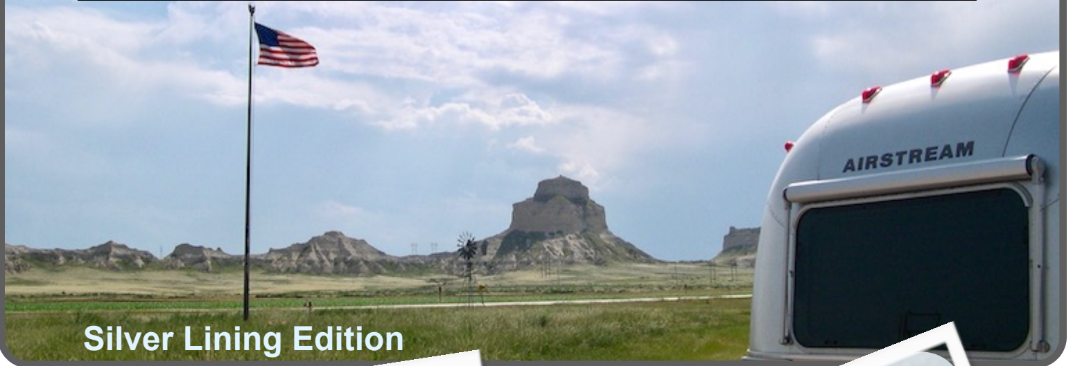
Silver Lining Edition

The Classic Airstream Club is an IntraClub of the Wally Byam Airstream Club International